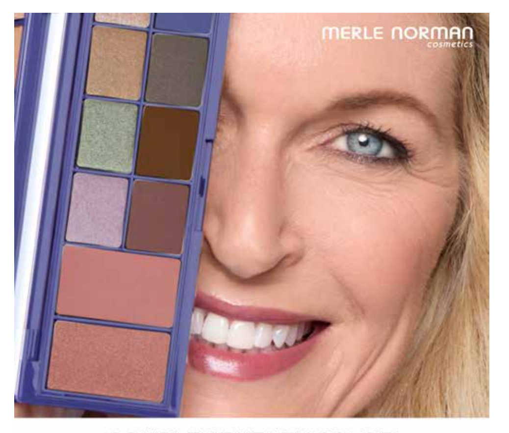
COMPLEMENTARY COLOR Shop matte to luminous shades that pair seamlessly in Fall's limited-edition Dual Beauty Eye & Cheek Palette .

Merle Norman Cosmetics & Day Spa 501 North Main Street (864) 224-3131 MerleNorman.com