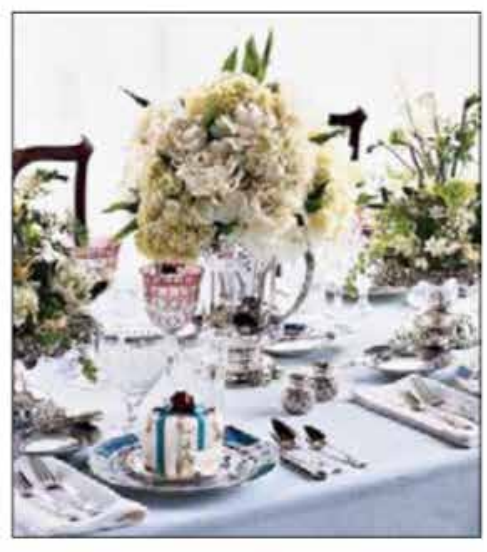
There's something to be said for a table set with silver.