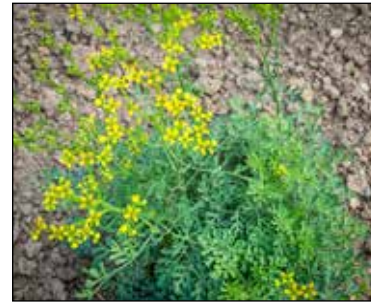
Rue in bloom

A little perennial, technically an herb, which has done great in the garden for several years is rue ( Ruta graveolens ). Tagged evergreen, it has been, even through our arctic blast last winter. What about zone 8 plants in that kind of whether swing? Rue did great through our very hot summer too. Foliage has a slight bluish tint to it. Deer pass it by. Possibly considered a short lived perennial, even though the original plants have been in my garden for many years, it reseeds so there are always more coming up here and there. It is not weedy. A little tiding up if it gets leggy is all the tending it has needed. Yellow flowers in summer look pretty contrasting to the foliage. Rue is a short plant, only about two feet or so tall and about